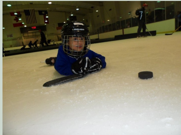
A new Aerodrome hockey player!